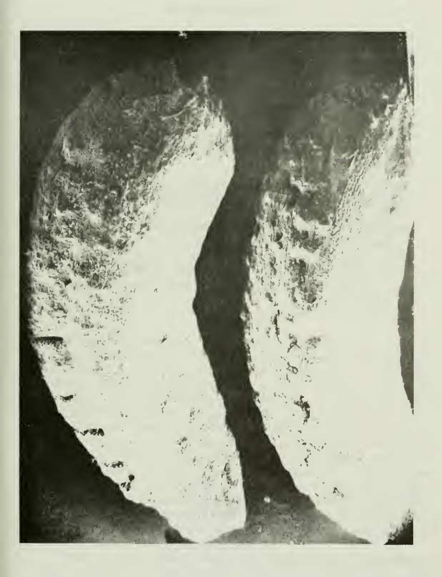
Figure 5. Achenes of The lesperma\ simplicifolium\ var.\ macrocarpum,\ 12X.